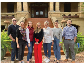
Bryan Museum Staff.